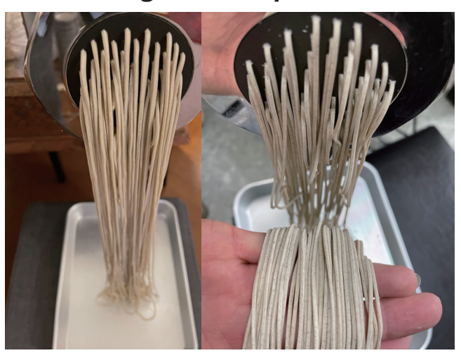
5. Extruded Noodles