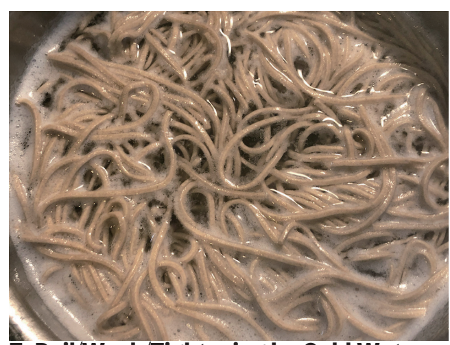
7. Boil/Wash/Tightening by Cold Water