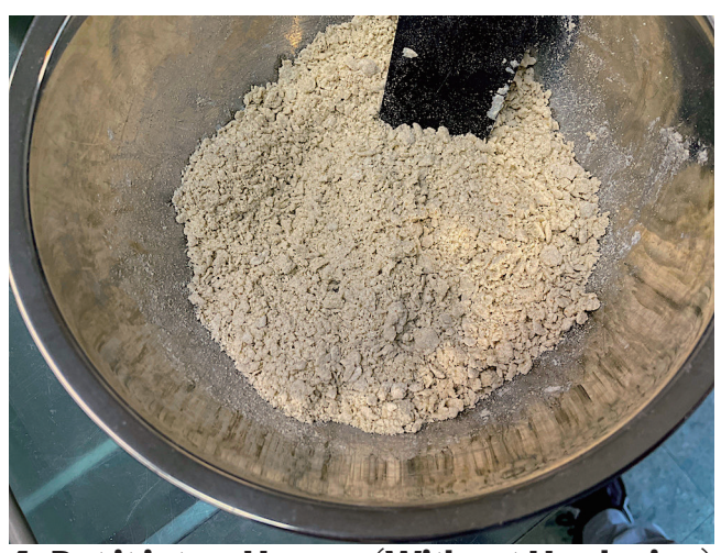
4. Put it into a Hopper (Without Hardening)