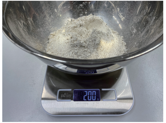
1. Measurement of Buckwheat Flour

TOWARI MACHINE · Noodle Making Procedure Quick Guide