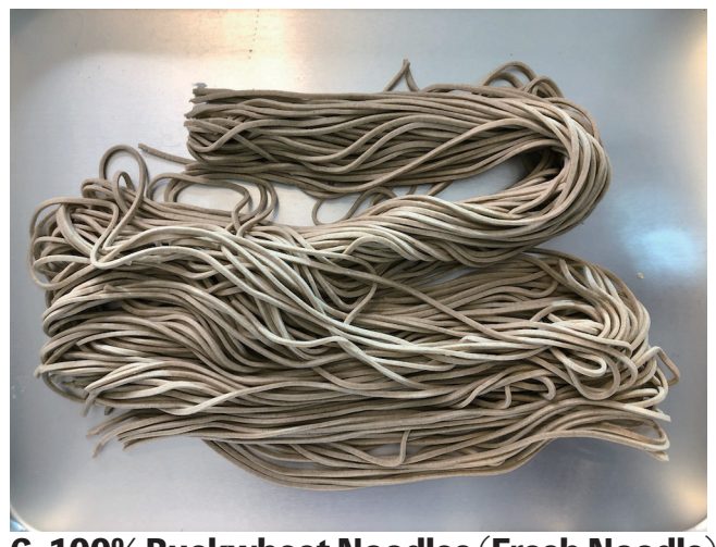
6. 100% Buckwheat Noodles (Fresh Noodle)