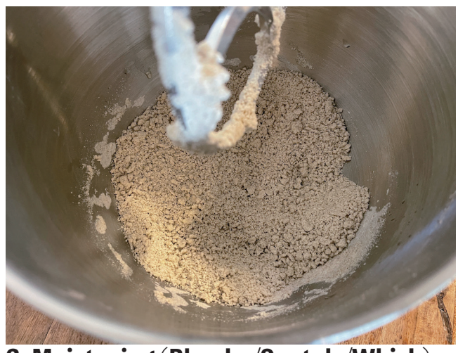
3. Moistening (Blender/Spatula/Whisk)