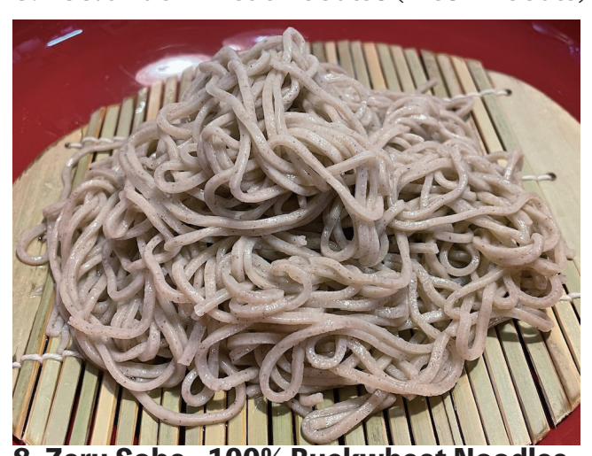
8. Zaru Soba - 100% Buckwheat Noodles